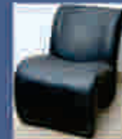
Leather Sofa - 1-Seat Hire Charge - Rs.2000/-