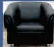
Leather Sofa - 1 Seat Hire Charge - Rs.2500/-