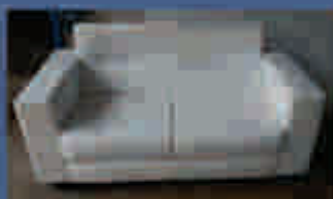
Leather Sofa White - 2 Seat Hire Charge - Rs.4000/-