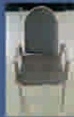
Cushion Chair (Armrest) Hire Charge - Rs.450/-