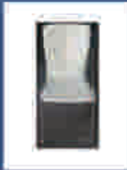
Moulded Chair Hire Charge - Rs.500/-