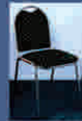
Cushion Chair Hire Charge - Rs.400/-