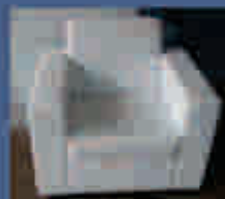
Leather Sofa White - 1-Seat Hire Charge - Rs.3000/-