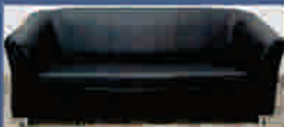
Leather Sofa - 3 Seat Hire Charge - Rs.4500/-