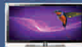
LED TV 42" Hire Charge Rs.1500/Dry